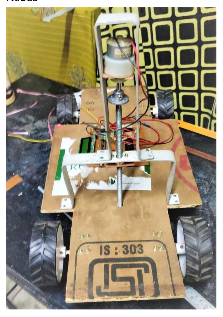
Fig.2: Battery operated wheel