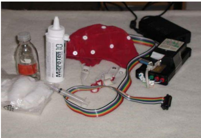
Figure 2: Equipment for EEG recording: amplifier unit, electrode cap, conductive jelly, injection, and aid for disinfection.