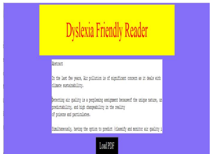
Fig -2: chunking of Text