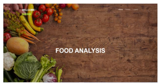
Fig – 3: web page