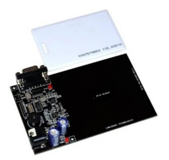
Fig - 1: RFID reader