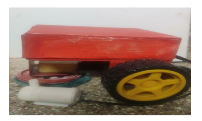
Fig. 6. 1. Experimental Output

Floor Cleaner Robot is intended to cause cleaning interaction to become simpler as opposed to by utilizing manual. The fundamental goal of this venture is to plan and actualize a story cleaning robot (which are utilized in emergency clinics) model by utilizing NodeMCU