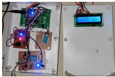
Fig 5: Prototype model result for dry eye