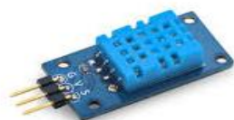
Fig 2: humidity sensor

Humidity Sensor is the devices that can be widely used in consumer, industrial, biomedical, and environmental etc. applications for measuring and monitoring humidity.