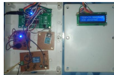
Fig 6: Prototype model result for abnormal eye