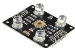
Fig 3: RGB sensors

5.4 RGB COLOUR SENSOR The color sensor detects the surface of the color, usually in the RGB scale. The color sensor can discriminate between the colors and measures the intensity of the reflected light.