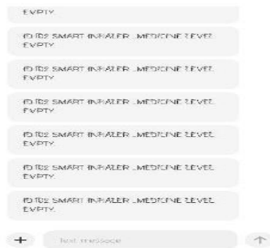
Fig: 6.4 Experimental Setup