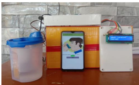
Fig: 6.3 Receiving SMS Or User