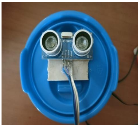
Fig: 6.2 Ultra Sonic Sensor