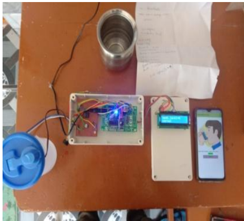
Fig: 6.1 Android Application and Lcd Display