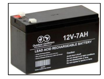
Fig-4: Lead-Acid Rechargeable Battery

from wastes caused by other batteries as they are disposed after one time use [4]. Lead Acid batteries hav e long life cycles, high discharge rates and are inexpensive. So, a lead acid battery is suitable and reliable battery to use in bicycle power generation. Fig-4 shows a 12V Rechargeable Lead acid battery.