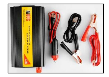
Fig-5: 12V dc to 220V ac Power Inverter

A power electronic device or a circuit which changes the direct current (DC) to alternating current (AC) is an inverter or also called as power inverters. The device which is employed decides the resulting AC frequency. According to our application a particular device will decide the input voltage, output voltage and frequency and overall power handling. The DC source is responsible to supply power to inverter and the inverter is not responsible for the DC power generation [9]. A stable DC power source which is capable of supplying enough current is required by the power inverters for the power required by the system. The design and purpose of the inverter is the deciding factor for the input voltage. Fig-5 shows the 12V dc to 220V ac Power inverter.