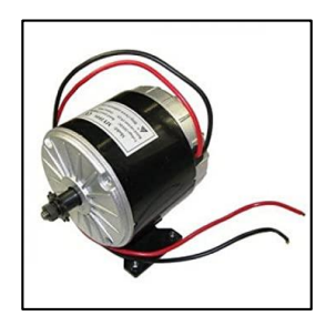
Fig-3: Permanent Magnet DC Generator

be reversed when the rotor north pole passes the stator south pole for keeping the torque generation in same direction. The segmentation of slipping contacts is done for this purpose. This segmented slip ring is commutator [4]. As the back wheel rotates; in return the rotor of motor also starts rotating at high speeds thus producing proper output. Fig-3 shows the Permanent magnet direct current generator.