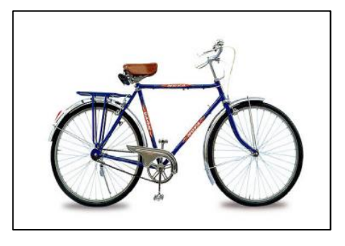
Fig-2: Regular Bicycle [6]

Racing bicycles are more expensive than general bicycle. So, as our projects aim is to make a cost effective bicycle power generator we will be using a general bicycle. Racing bicycles are used only in the developed areas of India and not in villages. Also the general bicycles are most used in villages in India so it is the best choice for power generation purpose [6].