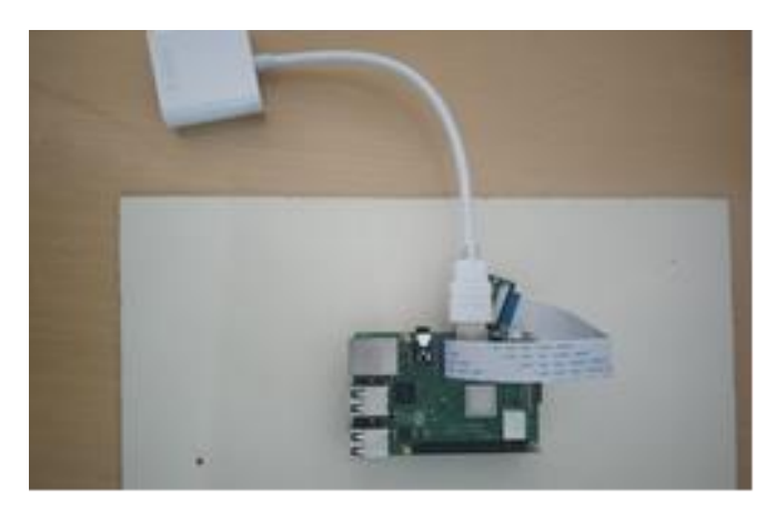
Fig -6: Output Setup

3. The data that have been stored in a sheet as it keeps updating the information as the person wears a mask or not.