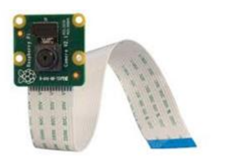
Fig - 2: Pi camera

The Pi's camera element is fundamentally a mobile phone camera element. Mobile phone electronic cameras varies from immense, much extravagant, cameras (DSLRs) in some regards. The major influentially of these, for deciding the Pi's camera, is that many mobile cameras (including the Pi's camera device) use a rolling shutter to capture images. When the camera requires to encapsulate an image, it skim out pixels from the sensor a row at a slot rather than capturing all pixel rate at once.