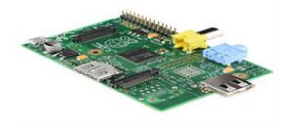
Fig -1: Raspberry pi

educational microcomputer for college kids and youngsters. The most purpose of calculating the raspberry pi panel is, to encourage study, demonstration and the innovation for college level students. The raspberry pi board may be a portable and low cost. Maximum of the raspberry pi computers is employed in the mobile phones. within the 21st century, the expansion of the mobile computing technologies is more extremely/greatly high, an enormous segment of this being driven by the mobile industries. The 98% of the cellular telephones were using machinery. The raspberry pi comes/has in two models, they are known as model A and model B. The most difference in the middle of model A and model B is USB port. The Model board will consume less/low power which doesn't include an Ethernet port. But, the model B board includes an Ethernet port and designed in china the raspberry pi approaches with a group of open source technologies, i.e. communication and multimedia webbing technologies. Within only the year 2014, the inspiration of the raspberry pi board launched the pc module that packages a model B raspberry pi board into module to be used as a neighborhood of the embedded systems, to encourage their use. The raspberry pi model aboard is meant with 256MB of SDRAM and model B is meant with 51MB.Raspberry pi may be a small size PC compare with other PCs. the traditional PCs RAM memory is out there in gigabytes. But in raspberry pi board, the RAM memory is out there quite 256MB or 512MB.