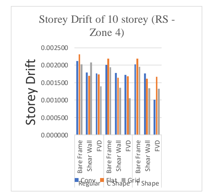
FIG4.2 Maxi. 10 Storey Drift for RS-zone 4