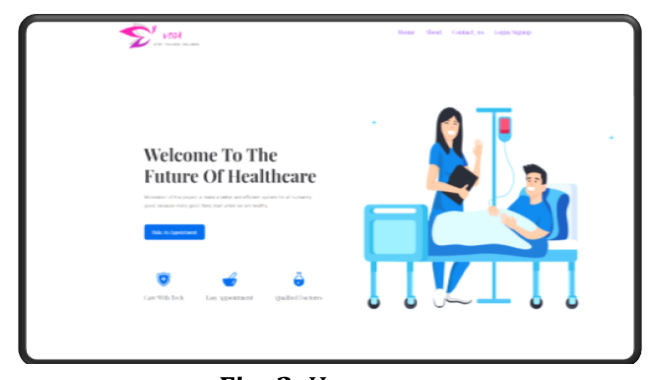
Fig -2: Homepage

Fig. 2 represents homepage of WebApp. Patient can go immediately to booking page from here.