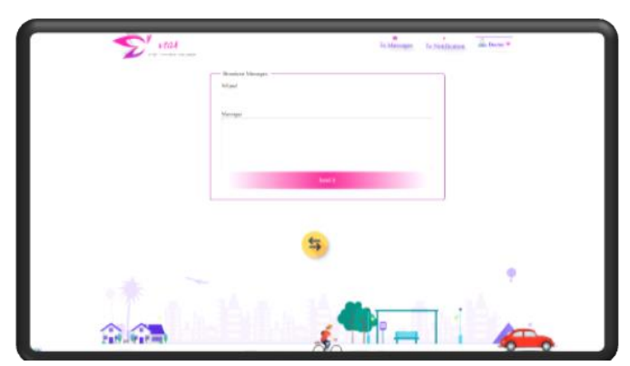
Fig. -6: Doctor Panel

Fig. 6 represent Doctor panel where, they can scan the ID of patient and get all the patient data in one click, Also they can broadcast message to all the patient also message to any individual.