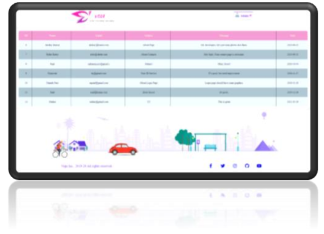
Fig. -8: Feedback Sheet

Fig. 8 is a screenshot of feedback sheet, which is taken from user to get feedback in order to improve further the web application.