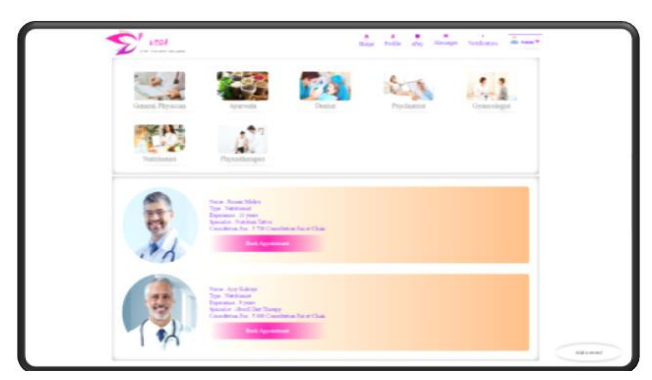
Fig. -4: Booking Page

Fig. 4 represents booking page, where patient can choose doctor through, their type of specific problem and then choose one based on review and year of experience.