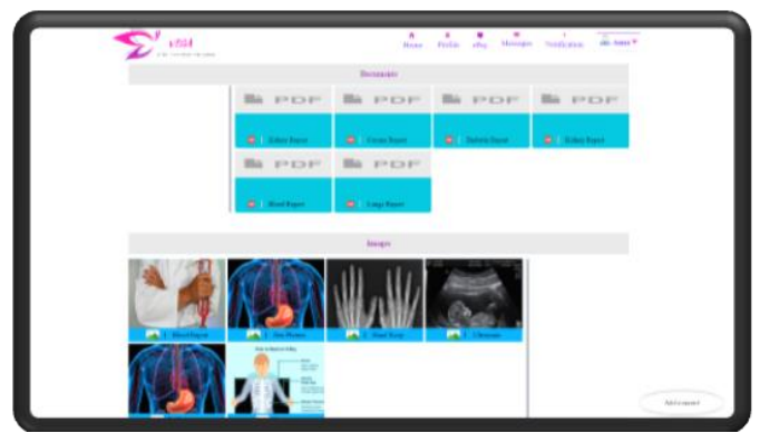
Fig. -5: Patient History

Fig. 5 This is patient history data, Patient can upload and manage their clinical data with ease. Patient can see, upload and download document and images.