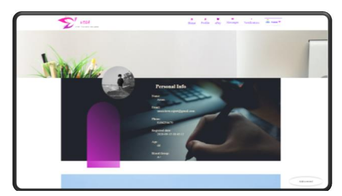
Fig -3: Patient Profile

Fig. 4 represents booking page, where patient can choose doctor through, their type of specific problem and then choose one based on review and year of experience.