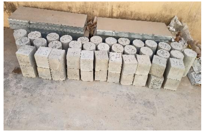
Fig-5.1 Casting Process