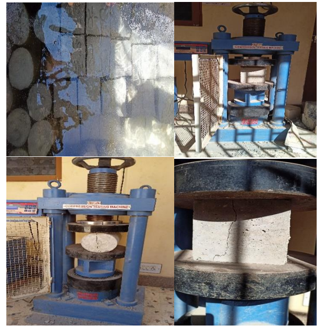
Fig-6.1 Testing of Specimen