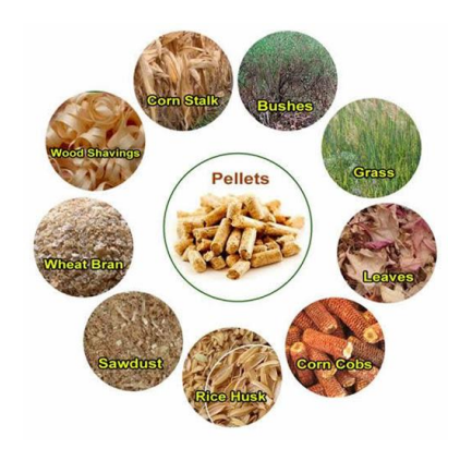
Fig3.2.1. Pellet materials

The recent advancement in technology and research had helped bioenergy to achieve new heights but still the gap between bioenergy efficiency and renewable energy source efficiency remain big. Consider coal which have kcal/kg value ranging between 4800-7000 and standard biomass pellet have kcal/kg from 3500 to 4200. The energy to volume ratio is also less as compared to coal. One of the major difficulties in using biomass pellet is transportation due to less durability nearly 10% of total biomass breakdown resulting in less efficiency. To avoid this we have used wax to cover it with thin wax so that durability is increased.