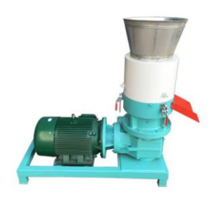
Fig3.4.1. Pellet Machine