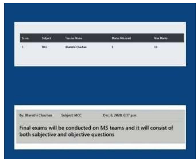
Fig 2. Viewing marks allocated and checking notice