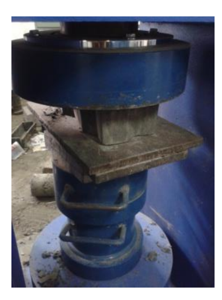
Fig -1: Compression test

International Research Journal of Engineering and Technology (IRJET)e-ISSN: 2395-0056Volume: 08 Issue: 05 | May 2021www.irjet.netp-ISSN: 2395-0072