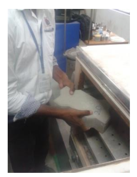
Fig -2: Water absorption test

One control specimen of the Normal paver block was cast to compare the results of the Red Mud Paver which was partially replaced by Red mud with Cement. The testing set up for compression and water absorption tests is shown in Fig-1 and Fig-2.