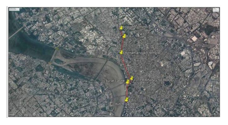
Fig -2: Heritage