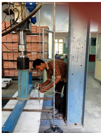
Fig-2: Experimental Setup for Testing

Experimental setup for the testing of composite slab specimen comprises supporting beams, 32mm diameter rods for distributing point load into line load, spreader beam, built up section to transfer load from actuator and 250 kN actuator to provide loading. The composite slab specimen shall be tested for flexure with two line loads applied at one-third spans. This is known as Four Point Bending Test. In this study, only static loading is applied.