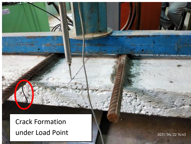
Fig-3: Crack Formation under Flexure

Composite Deck Slab Specimen underwent brittle failure as it is evident from the test results. As soon as the loading started, the specimen underwent deflection only up to 2.5 mm. Finally, at the ultimate load there is a jump in deflection from 2.5 mm to 5.2 mm. Before failure a sharp cracking sound could be heard. This is the result of complete debonding of concrete from the decking sheet. At this stage, the concrete in the compression zone underwent crushing at the mid span location.