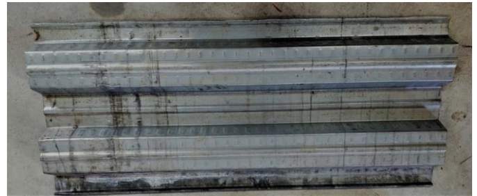
Fig-1: GI Deck Sheet Used for Deck Slab Construction