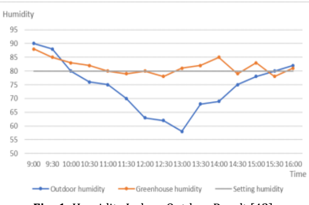
Fig -1: Humidity Indoor-Outdoor Result [42]