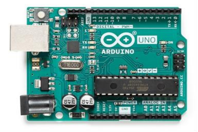
Fig 1. Arduino Uno

interface to various expansion boards and other circuits.