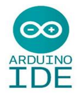
Fig 6. Arduino IDE

Arduino IDE means Arduino Integarted Development Environment. It is a cross platform where it is written from the functions of C and C++. It is an open source software where it is easy to write the code and upload to the board. This can be used with any Arduino board.