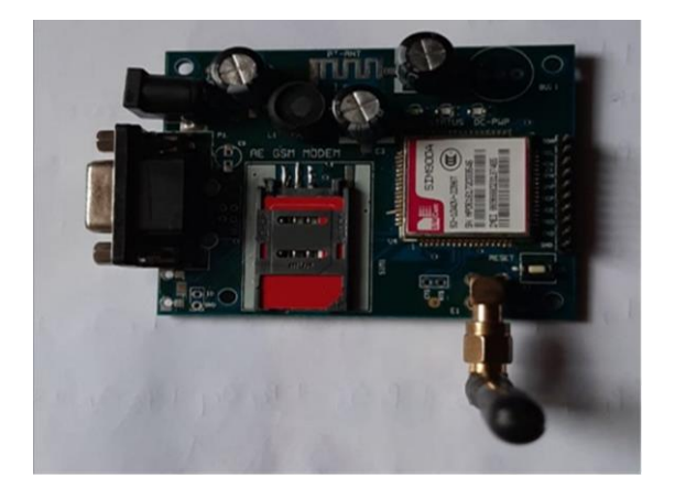
Fig 5. GSM module

It is a hardware device that uses GSM technology to establish an information link to a far off network. It is a second generation technique that uses Time Division Multiple Access technique. It uses 850MHz, 900MHz, 1800MHz and 1900Mhz frequency bands for transmitting mobile voice and data services. It digitizes the data and sends through the channel in two streams within a particular time slot. It can carry data rates of 64kbps to 120 mbps.