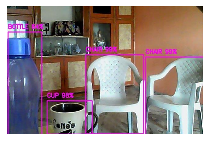
Fig -2: Results

help them in every way covering corner things also of indoor environment and in noncrowded area.