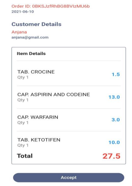
Figure 4: Order Details

The details of the medicines purchased with the total amount in the admin page as shown in Figure 4.