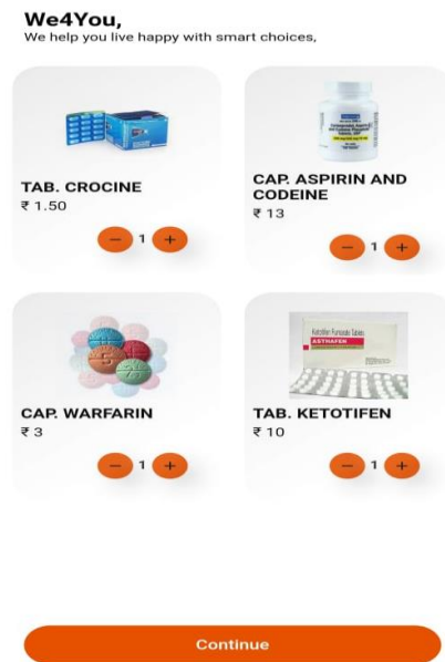
Figure 2 : Medicine order

The user uploads their prescription to the system, the list of medicines they can purchase will be shown as in Figure 2 with the quantity required and the price.