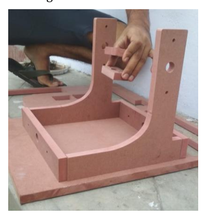
Fig.2.3 Assembled Parts

Electrical System:- Arduino uno r3 is picked to be the control unit in this undertaking. The arduino uno is a microcontroller board reliant upon the ATmega328 chip. The microcontroller board is streaked with G-code arbiter code which was written in the C language .The control board is reliable to produce the control signal for relating request signal from the PC to the stepper motors which is clearly controls the development of the contraption way. shows the for all intents and purposes of the Arduino pins as used by GRBL. The driver called easydriver .as the stepper motor driver. It gets steps signal from microcontroller and convert it into voltage electrical signs that run the motor.