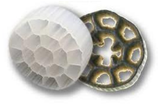
Fig -1 MBBR Media

The MBBR system consists of an aeration tank (similar to an activated sludge tank) with special plastic carriers that provide a surface where a biofilm can grow. The carriers are made of a material with a density close to the density of water (1 g/cm<sup>3</sup>). An example is high-density polyethylene (HDPE) which has a density close to 0.95 g/cm3. The carriers will be mixed in the tank by the aeration system and thus will have good contact between the substrate in the influent wastewater and the biomass on the carriers. The MBBR system is considered a biofilm process.