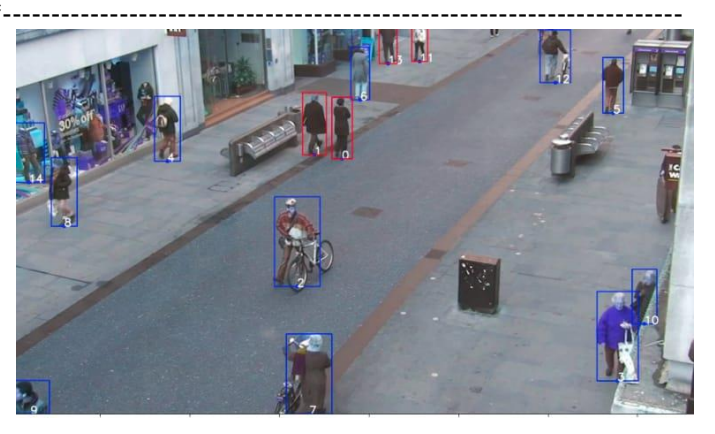
Fig2 : Social distancing detection