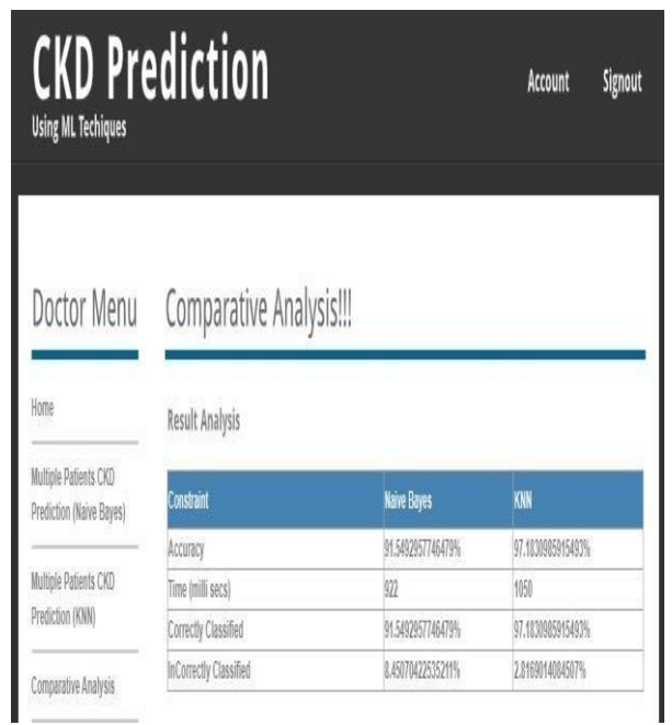
Fig 2: DATA VISUALIZATION