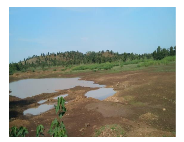
Fig 4.2 Dongargaon Village Watershed Catchment Area

Graduated terrace steps are commonly used to farm on hilly or mountainous terrain. Terraced fields decrease both erosion and surface runoff and may be used to support growing crops and that require irrigation.