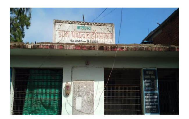
Fig 4.1 Gram Panchayat Dongargaon