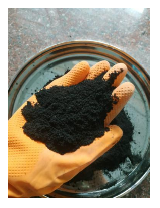
Fig 4: Rubber crumbs

When rubber is added to foam concrete by replacing sand its density decreases. The main reason for this because rubber is having lower density compared with sand.When rubber is replaced by sand with about 7.5%, its split tensile strength increases. After 7.5% increment of rubber causes decrease in strength In case of flexural strength, it increases with increase in rubber content but beyond 17% it start to decrease[6].The main reason behind the decrease in strength due to addition of rubber is that it has less adhesion between crumb and cement paste.This will lead to formation of crack and propagation in inter facial zone between RTC and hydrated cement[7].The water absorption rate of rubber concrete mix will be more because it creates more voids which lead to more water absorption.