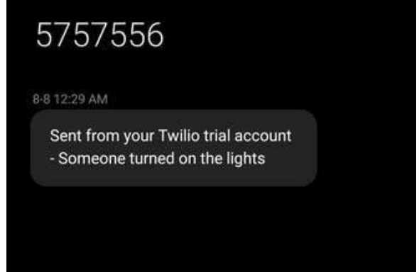
Fig -4: SMS Recieved

You can observe the SMS which is received when there is a sudden change in light intensity.