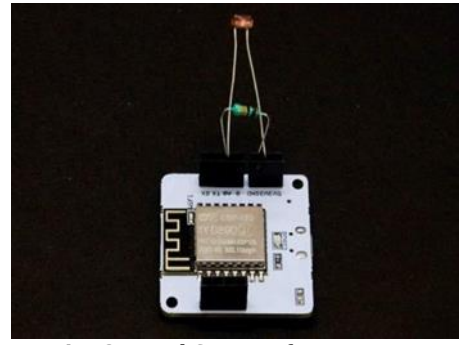
Fig -2: Final Set up of IoT Device

Thus, we are constructively measuring the voltage across the 10 k \, Ohm \, Resistor \, and \, the \, final \, circuit \, should \, look \, like \, the \, image \, below: