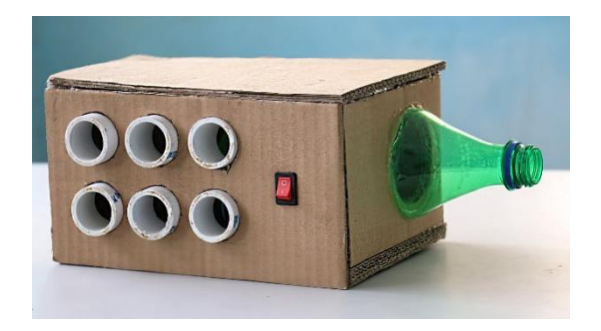
Fig-1: Smoke Absorber

What is a Smoke Absorber? This is a tool that's want to filter the inside air to stay the environment clean by removing bacterial fumes, combustion products, bad steam and odor, heat, and grease. A mechanical fan that is used pulls out harmful fumes and gases with a carbon filter.[1]