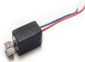
Fig. 4. Vibration Motor

It is a small built-in vibration motor module. After inputting 5V power, you can control ON / OFF or vibration intensity of motor through digital signal.