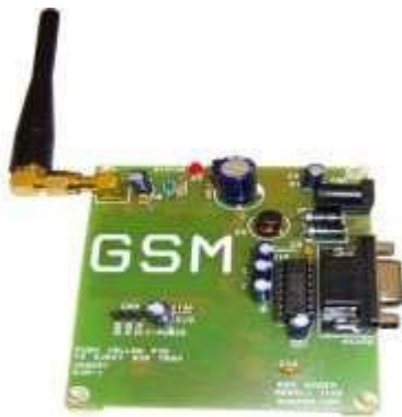
Fig. 3. GSM

GSM (Global System for Mobile communication) digital mobile telephony system which uses a variation of time division multiple access and is the most widely used of the three wireless telephony technologies (TDMA, GSM, and CDMA). GSM digitizes and compresses data, then sends it down a channel with two other streams of user data, each in its own time slot. It operates at either the 90MHz or 1800 MHz frequency band. GSM (Global System for Mobile Communications, originally Groupe Special Mobile), is a standard set developed by the European Telecommunication Standard Institutions (ETSI) to describe protocols for second generation cellular used by mobile phones.