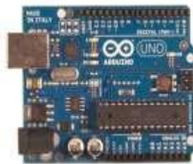
Fig. 2. Arduino uno

It is a microcontroller based on the ATmega328. It is having 14 digital I/O pins, 6 analog inputs, 16MHz local oscillator, a USB connection, a power jack, an ICSP header and a reset button. The board is equipped with sets of digital and analog input/output pins that may be interfaced to various expansion boards and other circuits. Arduino is a popular tool for IoT product development as well as one of the most successful tools for STEM/STEAM education[3]. Hundreds of thousands of designers, engineers, students, developers and makers around the world are using Arduino to innovate in music, games, toys, smart homes, farming, autonomous vehicles, and more.