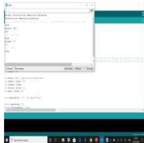
Fig. 10. Output of Text to Morse

The conversion of normal text to Morse code is required when the message sent by a normal user is to be received by the blind user. The message from the mobile phone of the normal user is received by the device and then it converts this text into Morse code which is readable by the blind person. The components used in the conversion process of normal text to Morse code are an Arduino Uno, a GSM module and vibration motors. The SIM card of the blind user is inserted in the GSM module. The GSM module will capture and show the range by blinking a LED. When a message is sent by a normal user, the message reaches the GSM module and transfers the text to the Arduino Uno. The Arduino Uno converts this text into Morse code text and it will be received by the blind user in the form of vibrations that will be produced by the vibration motor. The blind user who already knows the Morse code could read it easily by sensing these vibrations.