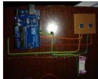
Fig. 7. Morse To Text Conversion

Text to morse code conversion section includes Arduino, GSM Module, two vibration motors(Fig-8). The vibration