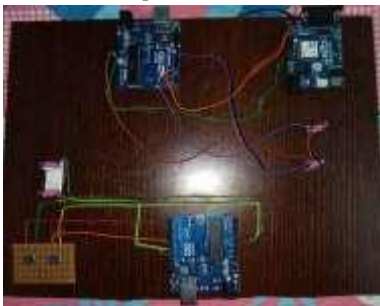
Fig. 6. Hardware Setup

This communication system has two sections, morse code to text conversion and text to morse code conversion. Embedded C is used to convert the information. The Fig 6 shows the hardware setup.