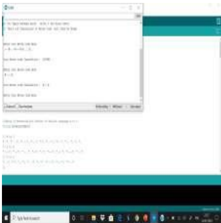
Fig. 9. Output of Morse to Text

The conversion of Morse code to normal text is done to send a message from the blind user in Morse code and to receive the message by the normal users in normal text format. We have incorporated our device in such a way that the message entered by the blind user through the button is converted into normal text by Arduino UNO and the normal text will be displayed on the screen or the monitor.