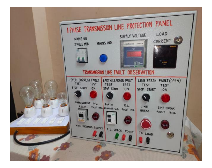
Fig. 2 Protection panel