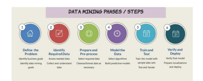
Fig 2:Data mining steps