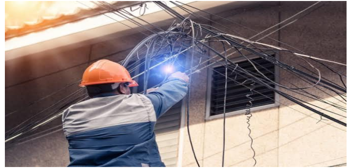
Fig 3.2 Accident due to Electrocution.

In construction, workers perform a great diversity of activities, each one with a specific associated risk. The worker who carries out a task is directly exposed to its associated risks and passively exposed to risks adhered by nearby co-workers. Building design, materials, dimensions and site conditions are often unique, which requires adaptation and a learning curve from site to site. Injuries may occur in a number of ways and at every juncture of the process.