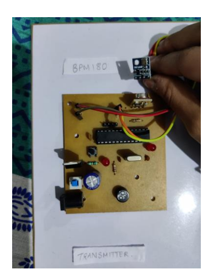
Fig -2: Transmitter Module

International Research Journal of Engineering and Technology (IRJET)e-ISSN: 2395-0056Volume: 08 Issue: 07 | July 2021www.irjet.netp-ISSN: 2395-0072