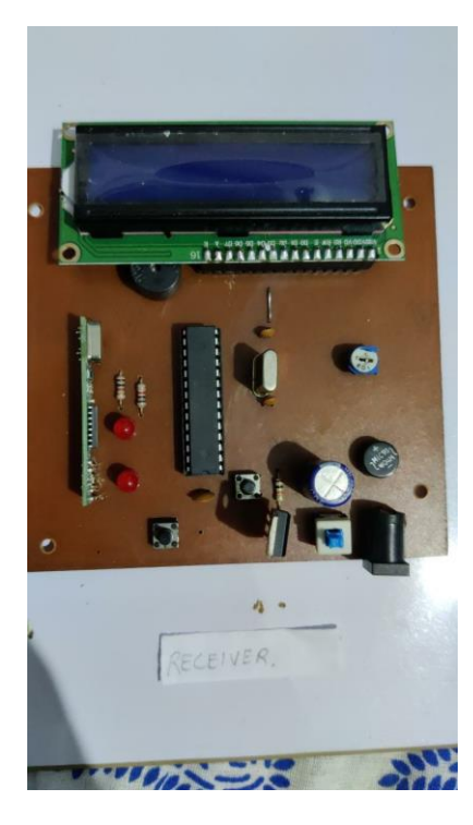
Fig -3: Receiver Module

Here we can see the receiver side of the system which outputs the data to the LCD.