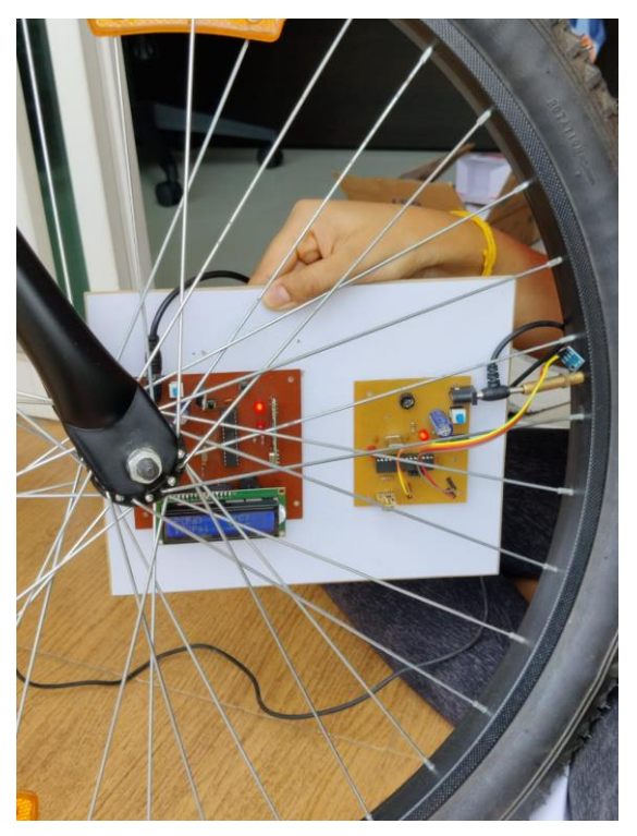
Fig 4: TPMS System

The above Fig 4 represents the whole system of tire pressure monitoring system.