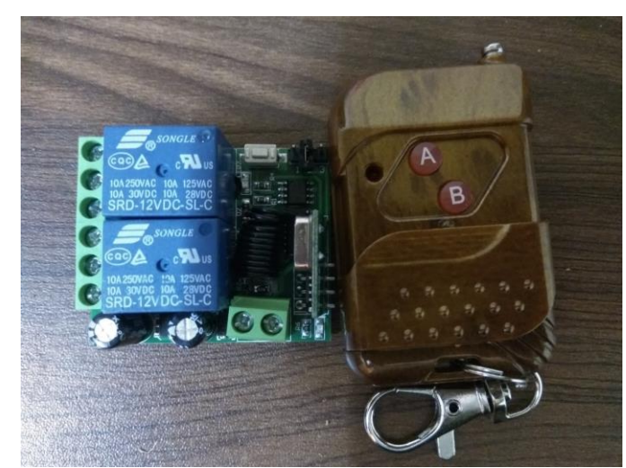
Fig -2: RF transmitter and receiver

Radio frequency (RF) module is a small electronics device used to transmit and receive the signals between to devices. In electronic system fixed system is required to communicate with another device wirelessly. In a RF circuit there are one transmitter and one receiver. RF circuit has wide range of applications. RF transmitter is a device which is used to transmit a required a signal to the receiver. It gives a signal to transmitter to perform required operations. They are available in different ranges and use as a system requirement. The transmitter used in this system has following specifications: