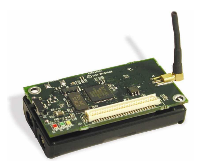
Fig -3: The MPR2400 sensor node with inbuilt antenna.

The micaZ is the latest node sensor from cross bow technology. The MPR2400(2400 mh z to 2483.3 Mhz band) uses Atmega 128L microcontroller.