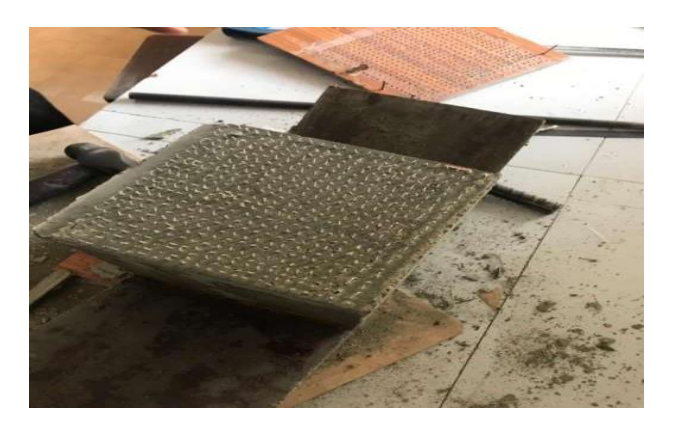
Figure-4: Specimen after de-molding and polishing

from casting. It is then polished their surfaces well by using sand papers. After that the specimens were marked by their respective identification marks.