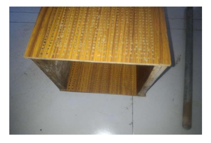
Figure-1: Mold with drilled holes

Panel molds are made up of four plywood faces, in which two faces having Thickness 5mm with wooden base plate. The two faces of plywood are undrilled and remaining two faces of plywood are drilled as per the following pattern. Holes are drilled in the faces having thickness 5 mm. Drilled and undrilled plywood plates are attach with each other. Two drilled plywood faces are placed opposite to each other so as to orient the optical fibers in a single direction.