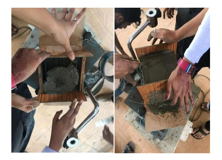
Figure-3: Stages of Pouring the Concrete

The concrete mixture produce from fine materials only it does not contain coarse aggregate. Poured the prepared mix carefully and slowly in fiber placed mold. The specimens were prepared by compacting the concrete in three layers. Table vibrator was used for contraction of concrete. After completion of contraction, excess material was take out and the mold was leveled by using a travel.