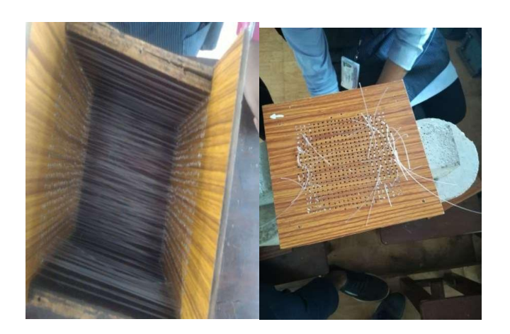
Figure-2: Arrangement of optical fibers