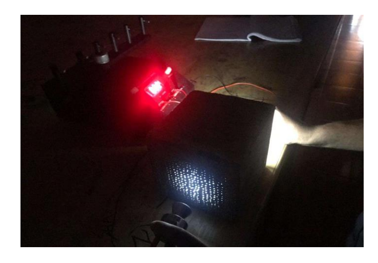
Figure-6: Light transmitting test in dark room

Table -1: Results of light transmitting test in day light