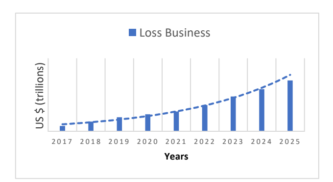
Fig -5: Business Loss Graph

According to our estimations, cybercrime will cost businesses worldwide $10.5 trillion annually by 2025, as you can see in fig-5.