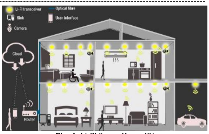
Fig -1: Li-FI Smart Home [2]

The Internet of Things (IoT) will make such a world home environment that provides innovative features, security, and smart service to humans. Although the smart home is more convenient and controls all home appliances, the smart home's, inter-connected, dynamic, and heterogeneous nature are the challenges in security issues. Considering the challenges on security issues in IoT we will focus on the encryption algorithm, Li-Fi technology, and various attacks in home automation security. As an example, in the below diagram Fig. 1: shows the architecture of the smart home scenario, consisting of many connected devices belonging to different applications, communicating among each other using Li-Fi technologies, and connected to a few gateways/routers which provide connectivity to outside networks. The gateway is the place where everything is associated with the cloud and users can access it.