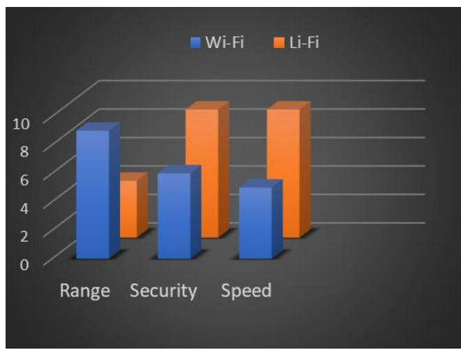
Fig -3: Li-FI Vs Wi-Fi

Li-Fi can be used underwater because visible light can travel a long distance in that medium for the transmission of data [2].