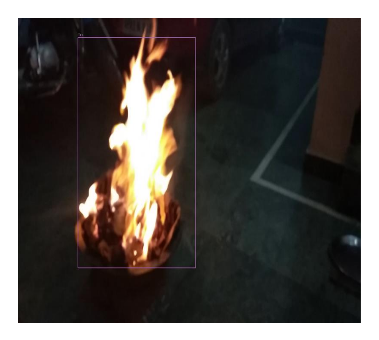
Fig4: Fire Detected as of input video

International Research Journal of Engineering and Technology (IRJET)e-ISSN: 2395-0056Volume: 08 Issue: 08 | Aug 2021www.irjet.netp-ISSN: 2395-0072