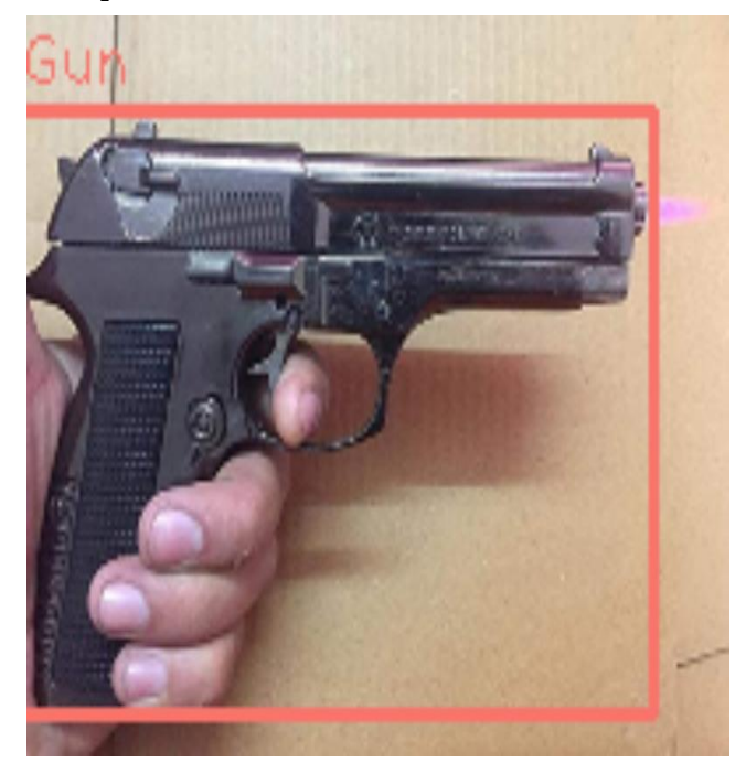
Fig 2: Gun detected as of input image