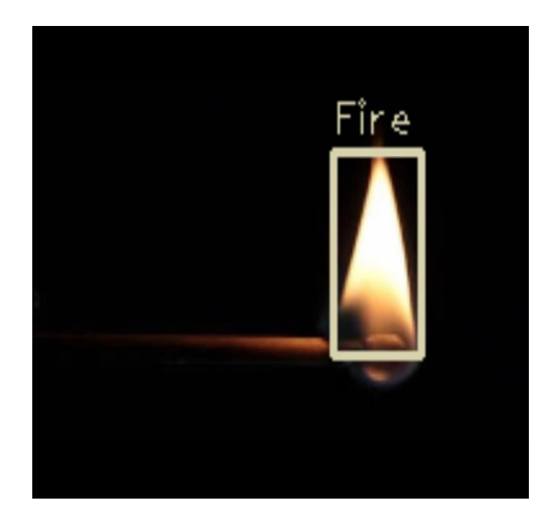
Fig 3: Fire detection as of input image