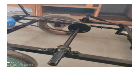
Figure 3.1 Pulley with V-belt