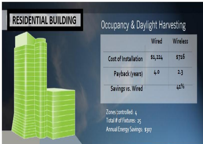
Fig- 3 Wired Vs. Wireless Cost Comparison

The case study presented for a living area resulted in a payback period of 2.3 years through the installation of wireless occupancy sensing and daylighting controls. The total material and labor cost was $516. The cost for wired occupancy sensors, photosensors, and switches was less expensive than their wireless counterparts. The labor costs of installing the wired devices, however, were many times more expensive than the labor costs for the wireless solution.