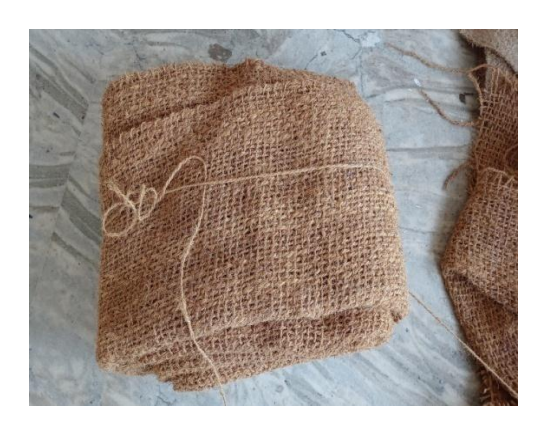
Fig-1: Unmodified coir geotextile