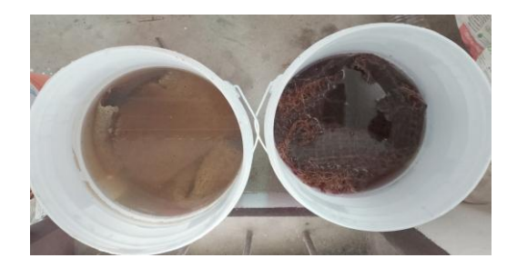
Fig-5: Samples immersed in water

Six samples each of modified and unmodified coir geotextile of dimension 300mm×300mm were completely immersed in 20L plain water. To study the effect of fertilizers that might leach into water from agricultural land, similar samples were immersed in 3% urea solution and 3% factamfose solution. Urea and factamfose were selected as they are the most commonly used fertilizers in kol fields. 3% concentration was chosen as it is the maximum concentration of fertilizer that might leach into water.