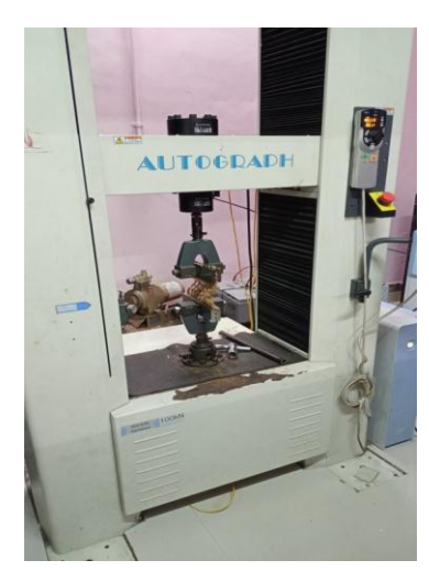
Fig-6: Universal Testing Machine

As per IS 13162 Part 5, tensile strength of coir geotextiles was determined in Universal Testing Machine at Central Coir Research Institute, Kalavoor, Alappuzha. The dimension of the samples used for wide width tensile strength test is 200mm×200mm (6). The samples were tested at a constant rate of traverse-20mm/min. Gauge length was 100mm.