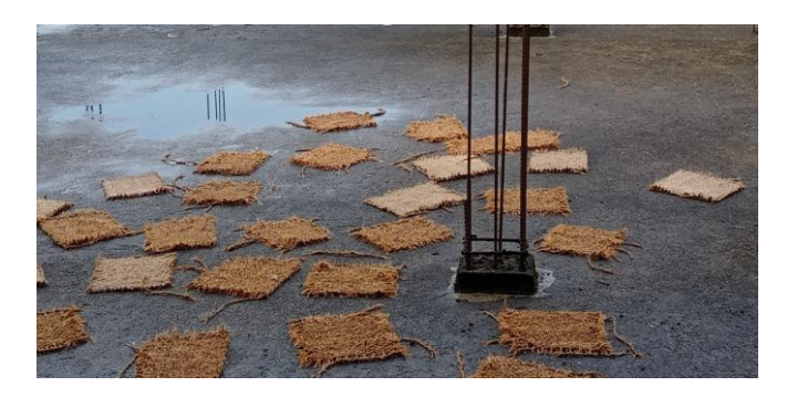
Fig-4: Samples exposed to natural condition

Six samples each of modified and unmodified coir geotextiles, of dimensions 300 \text{mm} \times 300 \text{mm} were placed on the roof top exposed to natural weather conditions for a period of 60 days.