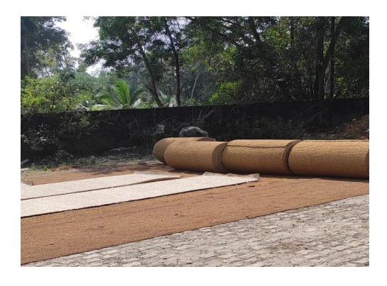
Fig-2: Modified coir geotextile