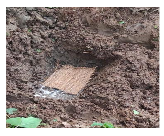
Fig-3: Sample burying in soil

Six samples each of modified and unmodified coir geotextile of dimension 3 00 \text{mm} \times 3 00 \text{mm} were buried in laterite soil for a period of 60 days. The samples were buried at a depth of 50 cm where water was found. Since the experiment was conducted during rainy season, the water content of the soil was obtained as 69.8%.