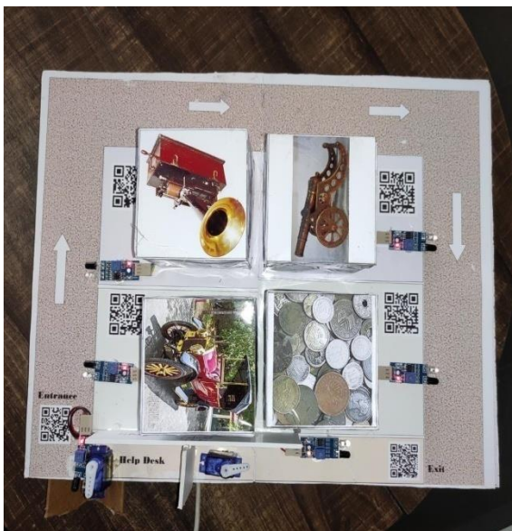
FIGURE 3: SMART MUSEUM