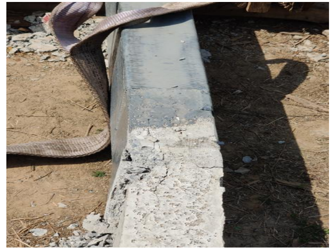
Fig -3: Test Sample No. 4