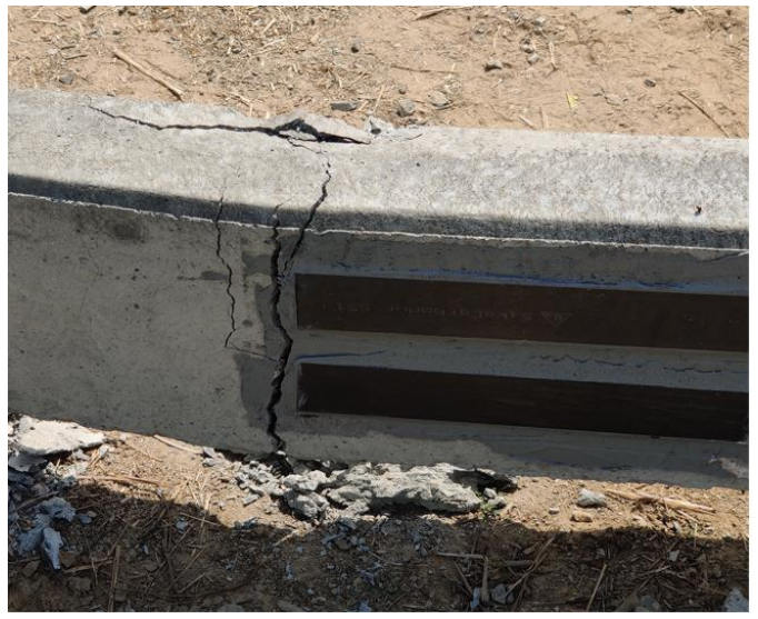
Fig -2: Test Sample No. 3