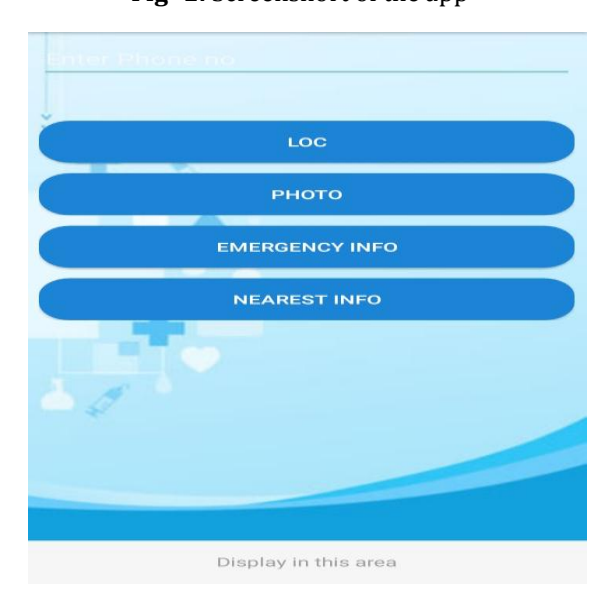
Fig -1: Screenshort of the app

In the current frameworks, we have referenced numerous Android applications having comparable component to my application. In that large number of uses, casualty's area is sent just a single time to the enlisted contacts in various structures like SMS, However in circumstances, the casualty may not be kept at one spot standing, she might move around. Thus, in that multitude of uses, we can know just a single area following the beginning of the application, yet for all intents and purposes after at some point she may not be available at that spot. The one of a kind element of my application is area is sent consistently for each five minutes. So, regardless of whether the lady is made to move around in the city, as a result of this element of constant area following, she can be safeguarded rapidly and securely. Likewise, one of the contacts will get a call, in some cases there might be opportunity for individuals not seeing the SMS, but rather in the wake of getting the call they get ready and can take a gander at the SMS and can distinguish that their almost ones is in peril rapidly.