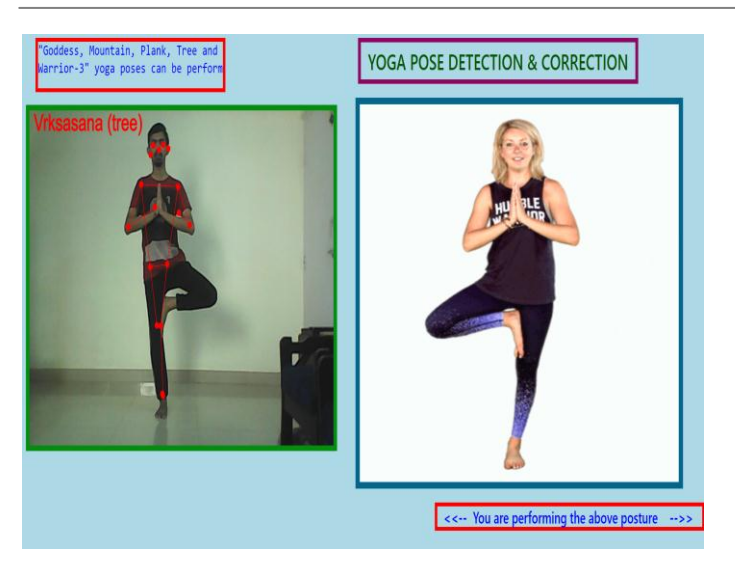
Figure 2: Vrksasana (tree) Pose

In the above picture, as the user is performing Vrksasana