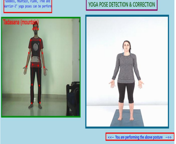
Figure 3: Tadasana (Mountain) Pose

(tree), the keypoints of the user like eyes, ears, nose, limbs are compared with the trained model. The yoga asana which will have the highest confidence will be displayed on the screen. As the user is performing Vrksasana (tree), its correct posture alongwith the steps will be displayed so that it could assist the user in performing the yoga asana. ountain, Plank, Tree a YOGA POSE DETECTION & CORRECTION yoga poses can be p