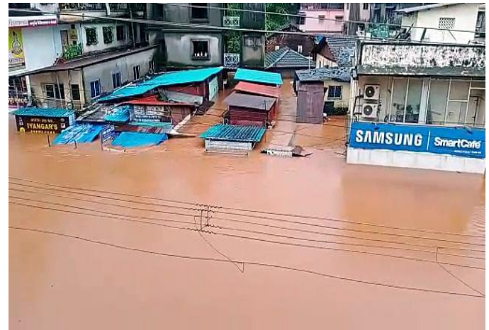
Fig -1: 2021 Floods in Chiplun, Maharashtra

Abstract - Natural disasters have caused a lot of damage and destruction throughout the world. A major natural catastrophe among all the disasters is flooding. Flooding is very common in India as India is one of the most flood-prone countries in the world with almost 30 million Indians getting affected on an average annually. India's average economic losses due to natural calamities are estimated at INR 746.83 billion, of which over INR 532.94 billion are attributed to floods. Along with financial and real-estate losses, it also causes emotional damage to people. To minimize these losses, we thought of different Flood mitigation measures and chose to further work on Amphibious housing. Amphibious houses are the structures that majorly work on two principles i.e. Archimedes Principle and Pontoon principle. So, these houses act like normal houses but when a flood occurs, it rises to the height of flood level and floats with the help of pontoons or hollow basements. It is supported by the vertical mooring poles to avoid displacement due to external forces. Once the floodwater is drained off, the house comes back at rest to the ground level. For making the houses float, the foundation or the sub-structure is made up of Expanded Polystyrene Foam (EPS) blocks. While the superstructure can be made using different materials like timber, EPS blocks, light-weight concrete, Ferro cement, etc.