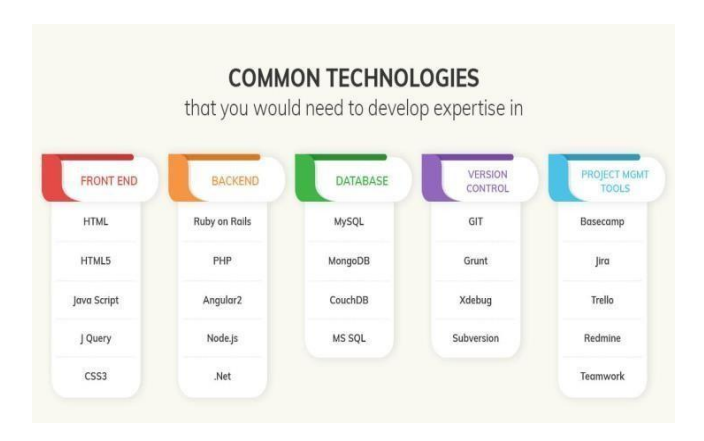
Fig 2. FSWD components

Volume: 09 Issue: 04 | Apr 2022 www.irjet.net p-ISSN: 2395-0072