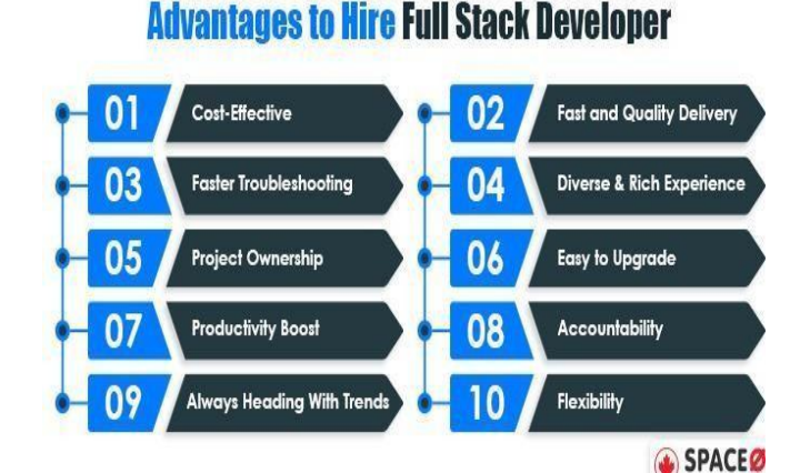
Fig 4. Advantages of FSWD

Refer to the figure 4. for the advantages of FSWD.