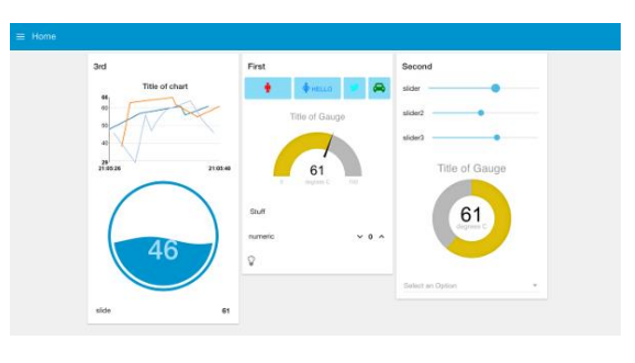
Fig -3 : Developed dashboard

First, the legacy device is connected through the IOT controller through supported communication like Modbus RTU, and Modbus ASCII the data communication between the plc and controller is carried through the node-red program after that the data from the plc is converted into useful and meaningful data and transferred to the app instantaneously through MQTT communication. In that, we can monitor a device remotely and can also control devices remotely.