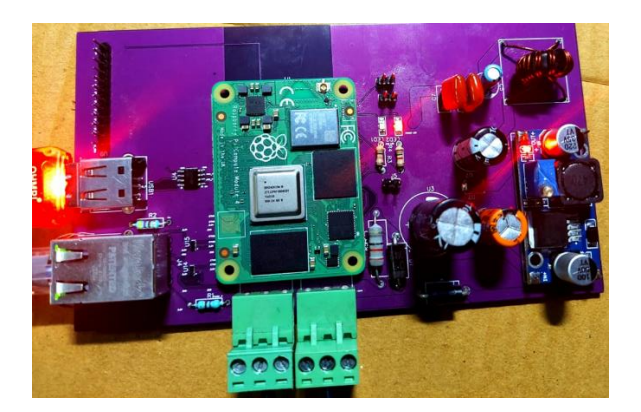
Fig -1: developed device

This device can be accessed through the web browser with the local IP address of 127.0.0.1880 and can be login through the default password after that we can use multiple nodes like MQTT mode MODBUS serial node, Modbus TCP node. And can be connected to the server Industrial protocols can be connected easily to these devices using ethernet and serial wires. After connecting it, it is turned on by using the power supply of 24V Through an ethernet cable or switch the device can be accessed through the web using the default IP address of the device. And the web portal can be logged in through the default username and password. In their it has a nodered interface for the device. There is lots of communication node for controlling the legacy devices through this device which is monitored and sent to the MQTT server.