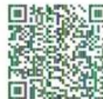
Fig. 2.-QR Code